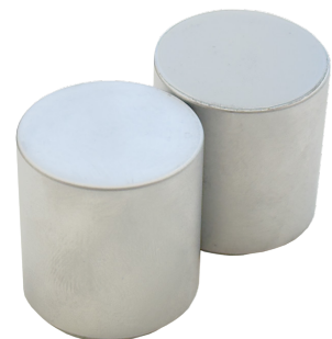
882/65SS 65mm Offset Magnetic Holdback Catch