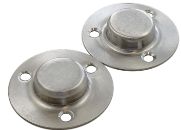
882/SS Magnetic Holdback Catch